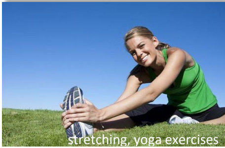
stretching, yoga exercises