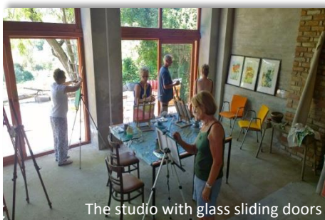
The studio with glass sliding doors